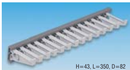
H=43, L=350, D=82

A 350mm aluminium rail complete with 15 moulded hooks which can be snapped onto the rail in any desired position. The rail can be mounted on any vertical surface (mounting screws supplied).